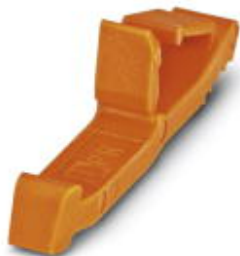
Latching, length: 28.9 mm, width: 3.3 mm, number of positions: 1, color: orange

Please be informed that the data shown in this PDF Document is generated from our Online Catalog. Please find the complete data in the user's documentation. Our General Terms of Use for Downloads are valid ( http://phoenixcontact.com/download )