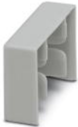
End cover for lateral connection of wiring bridges, 4-phase

Please be informed that the data shown in this PDF Document is generated from our Online Catalog. Please find the complete data in the user's documentation. Our General Terms of Use for Downloads are valid ( http://phoenixcontact.com/download )