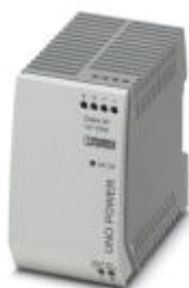
Primary-switched UNO POWER power supply for DIN rail mounting, input: 1-phase, output: 15 V DC/100 W

Please be informed that the data shown in this PDF Document is generated from our Online Catalog. Please find the complete data in the user's documentation. Our General Terms of Use for Downloads are valid ( http://phoenixcontact.com/download )